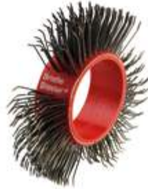
BRISTLE BLASTER® BELT, STEEL, 23 MM