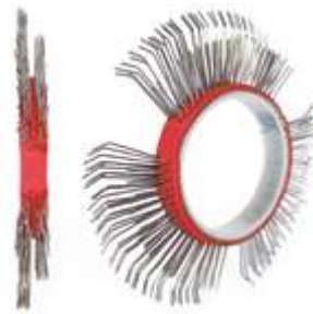
BRISTLE BLASTER® AXIAL BELT, STAINLESS STEEL, 11 MM, RIGHT