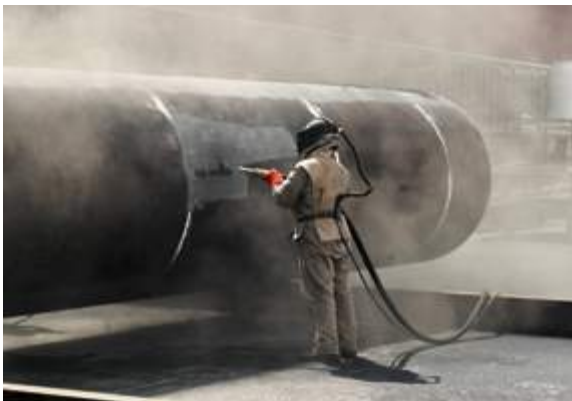
Conventional grit blasting