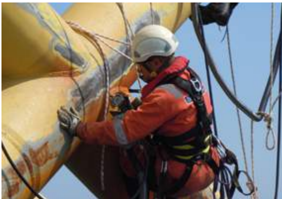
Bristle Blaster® on an offshore platform

Absolutely Gründlich stands for a thorough and sustainable long-term protection of your assets. MontiPower®-preparation from scratch!