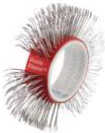
BRISTLE BLASTER® BELT, STAINLESS STEEL, 23 MM