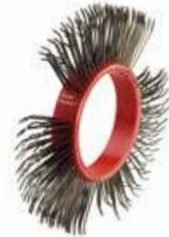
BRISTLE BLASTER® BELT, STEEL, 11 MM