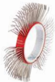
BRISTLE BLASTER® BELT, STAINLESS STEEL, 11 MM