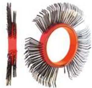
BRISTLE BLASTER® AXIAL BELT, STEEL, 11 MM, RIGHT