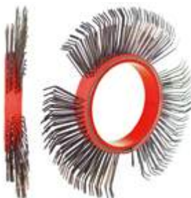
BRISTLE BLASTER® AXIAL BELT, STEEL, 11 MM, LEFT