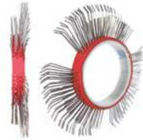
BRISTLE BLASTER® AXIAL BELT, STAINLESS STEEL, 11 MM, LEFT