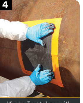
Kevlar® patches with 3X resin application (5 layers)