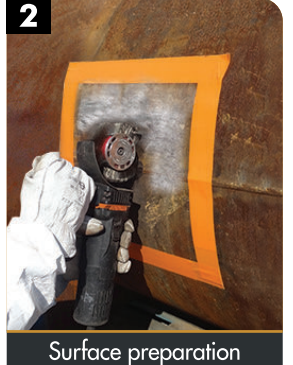
Surface preparation Sa21/2 / St3 and roughness Rz > 60 µm