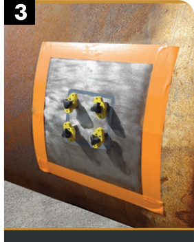
Steel plate application (with filler & magnets)