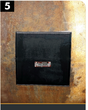
TANKiT® installed & traceability tag