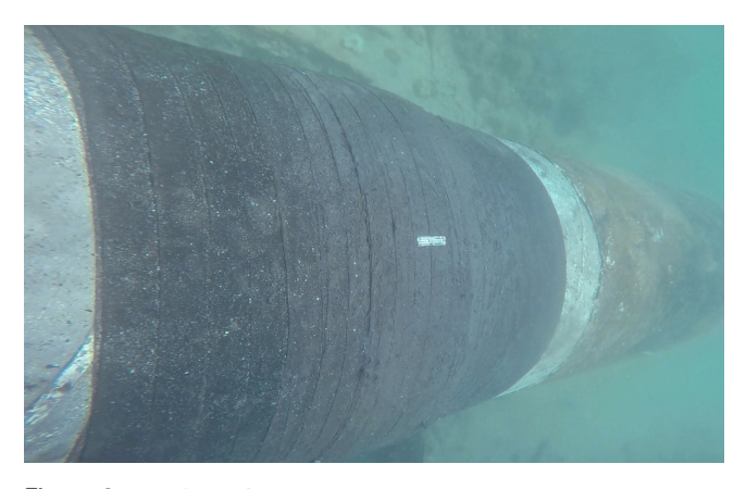
Figure 3. R4D-S reinforcement.