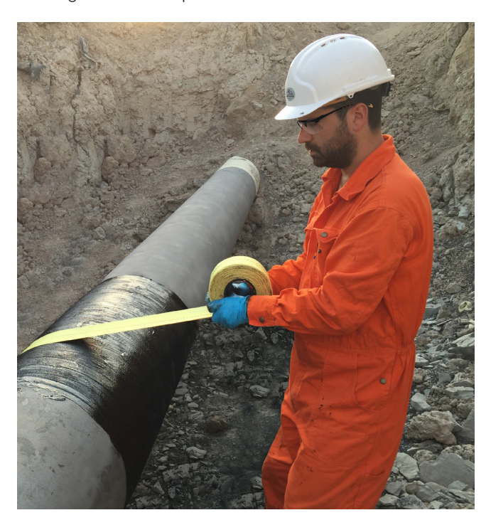
Figure 1. R4D wrapping in progress.

The repair is designed for a lifetime of 20 years. A good surface preparation prior to wrapping and a proper installation by trained and certified applicators are essential to guarantee the long-term of the repair.