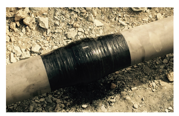
Figure 2. View of the finalised composite repair in Iran.

and specially designed equipment. To this purpose, 3X technicians and engineers are trained and certified to work offshore. For subsea repair requiring divers to perform the composite wrapping, 3X provides subsea operation supervision and co-ordination of technical repair divers (including saturation divers). The company developed a range of subsea tools to apply the composite repair in controlled conditions. These specific tools (i.e. BOBiPREG® – a unit designed to perform a good, regular and quick impregnation of the Kevlar tape with the resin before immersion) will guarantee the performance of the repair.